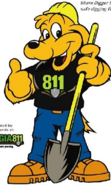
Where Digger Dog makes safe digging fun!

Presented by your friends at: GEORGIA811 Contact 811 before you dig.